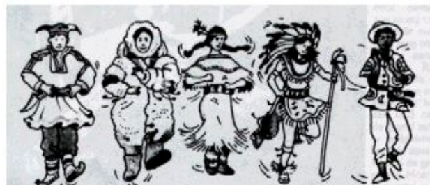
Lapland Eskimo USA Caribbean Islands