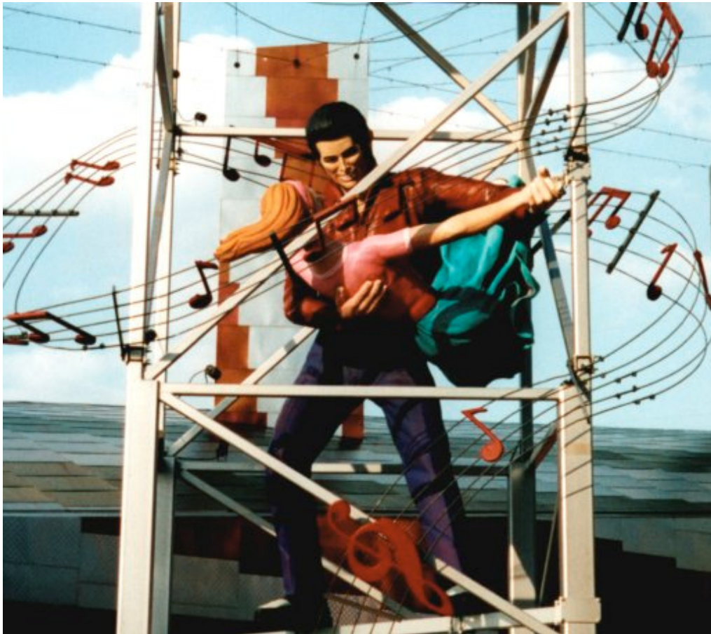
Rock 'n Roll dance couple in Disneyland Paris