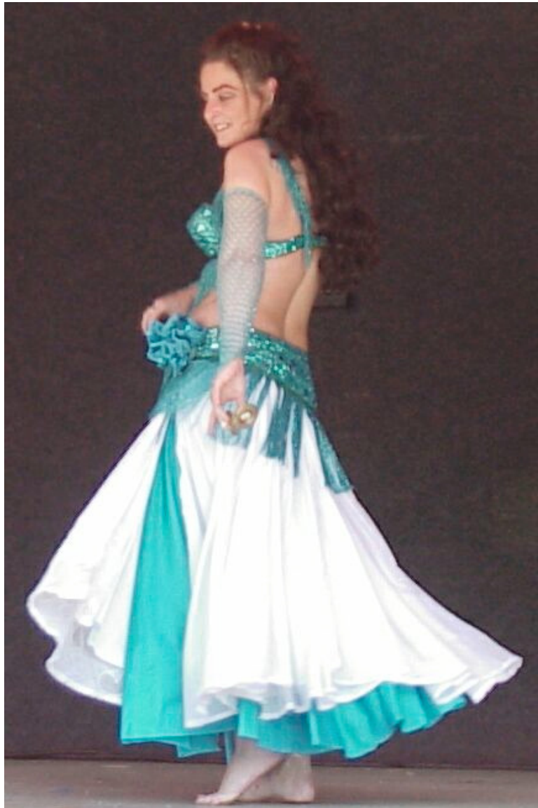
05-05-2000 – Belly dancer