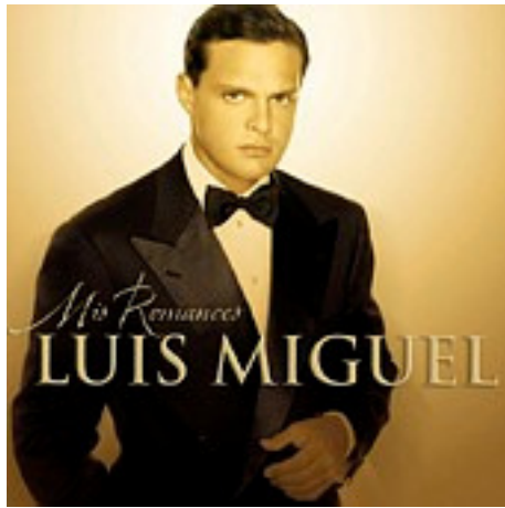
Luis Miguel Mis Romances (2001)

There are not many danceable songs on this cd, but sometimes listening on the couch is also nice.