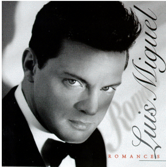
Luis Miguel Romances (1997)

The CDs of Luis Miguel are very suitable for studying the Bolero rhythm.