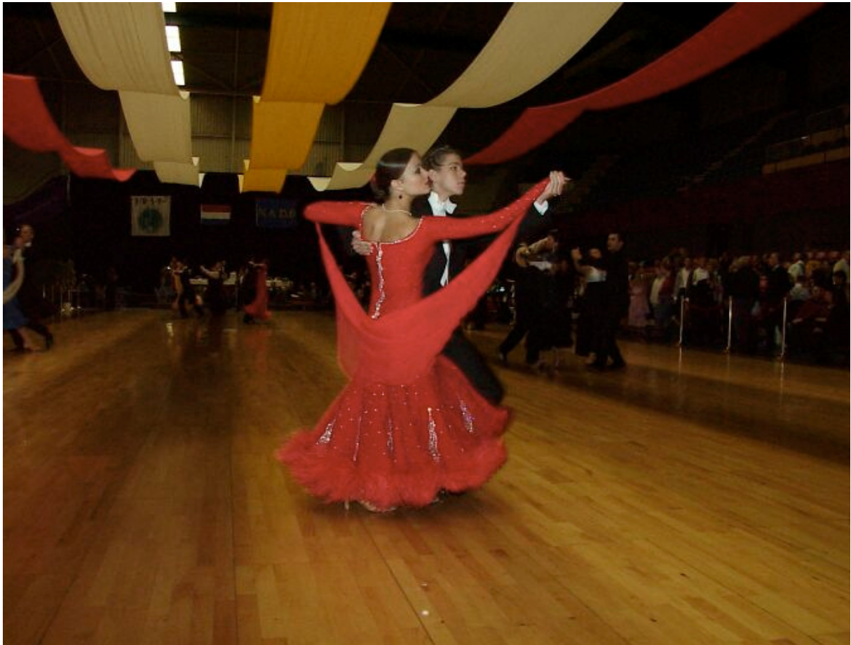
N.A.D.B competition in Den Bosch (The Netherlands)