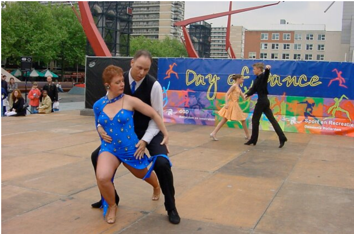
Day of Dance 2003 in Rotterdam