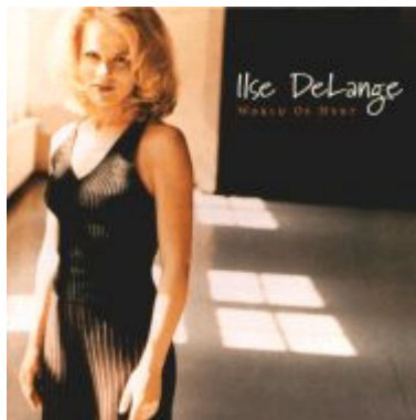
Ilse DeLange World of hurt

Country CDs are mostly very suitable for ballroom dancing and so is this CD. The song “If you had the heart” is a beautiful Slow waltz. “I’d be yours” is not really a Quickstep, but the tempo is perfect. Some dancers will probably have some trouble to dance to “What does your heart say now”.